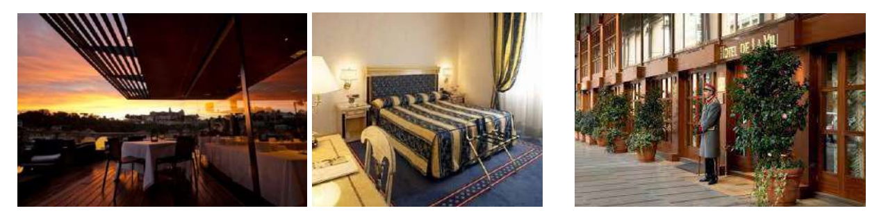
Hotel Excelsior San Marco

The most comfortable hotel in lower Bergamo and conveniently located for its many shops and restaurants, the four-star Excelsior San Marco is also just a short walk from the funicular leading to the medieval upper town. Rooms are decorated in traditional style and are surprisingly quiet, due to the hotel's setting in a large garden. All rooms for the tour are superior level, and include flat-screen television and Wi-Fi internet access. Facilities include a restaurant on the top floor with panoramic views and terrace seating, and hotel guests can pay to utilize the nearby spa and wellness center, which includes a swimming pool and fitness area.